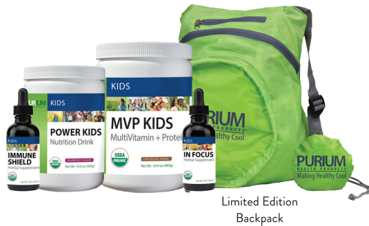
Limited Edition Backpack