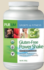
Power Shake Satisfy nutritional needs, suppress appetite