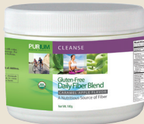
Daily Fiber Blend Fat-burning fiber