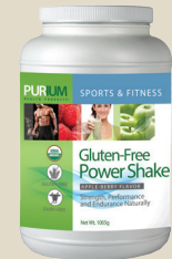
Power Shake Natural energy, endurance, strength & appetite suppression