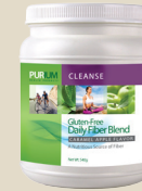
Daily Fiber Blend Gentle cleansing, increase adiponectin

Scientists have discovered the difference between lean and heavier-set bodies - a hormone called adiponectin. To keep losing weight after the 10-Day Transformation, our Reset Pack has 100% natural, organic and gluten-free superfoods that will stimulate your body to produce 40% more adiponectin in less than 100 days! This 40% increase is about the difference between lean people and those who are clinically considered obese.